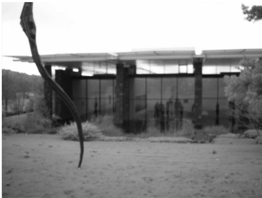
Artemis . Digital photo (2592×1944 pixels) in the infrared spectrum. Taken at Fondation Beyeler; silhouettes include sculptures by Alberto Giacometti (left, behind windows) and Louise Bourgeois (right, behind windows, plus one leg of Maman in front). The hourglass silhouette to the right could not be identified on non-infrared images taken shortly before+after. 2011.