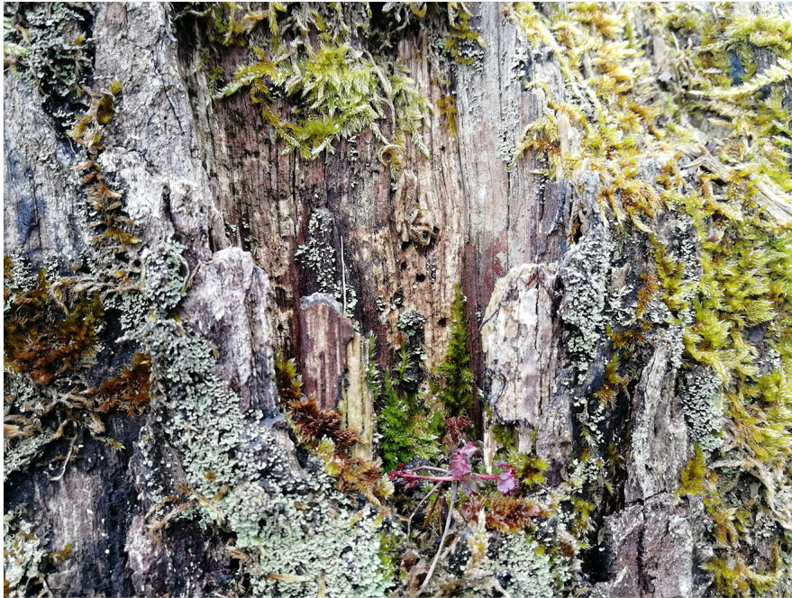
Spirit of China . Digital photo (3968×2976 pixels). Closeup of a tree in the Leilöcher nature reserve in Switzerland. 2023.