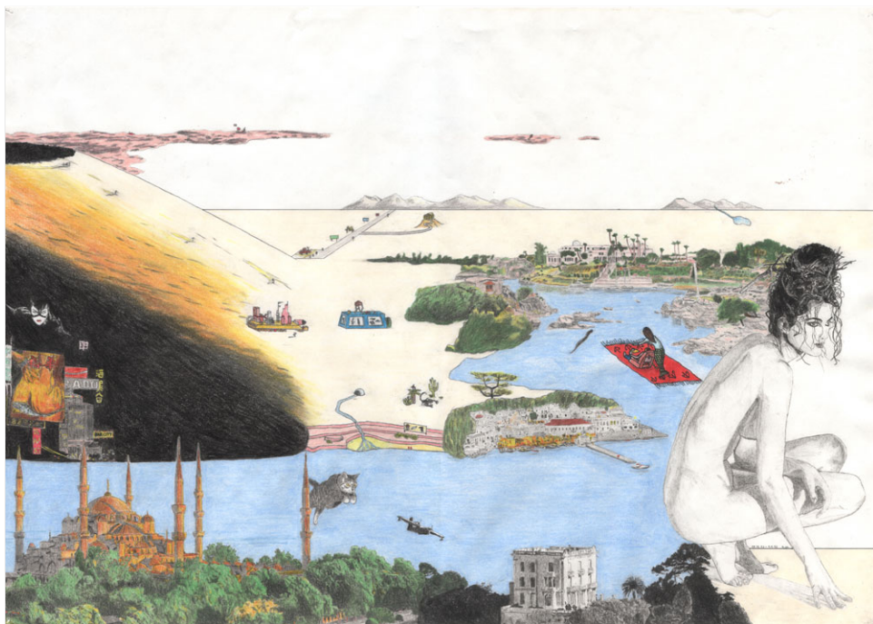
Fly like an eagle. Crayon and felt pen on marker paper (A3). Inspired by a dream. Includes traced “copies” of several photos from magazines, including from Egypt near the Aswan Dam, Mykonos, Istanbul, Hawaii, and Monaco with airplane+house (by Helmut Newton); the lady in the front is from an ad for Opium perfume by Yves Saint Laurent. 1992/93.