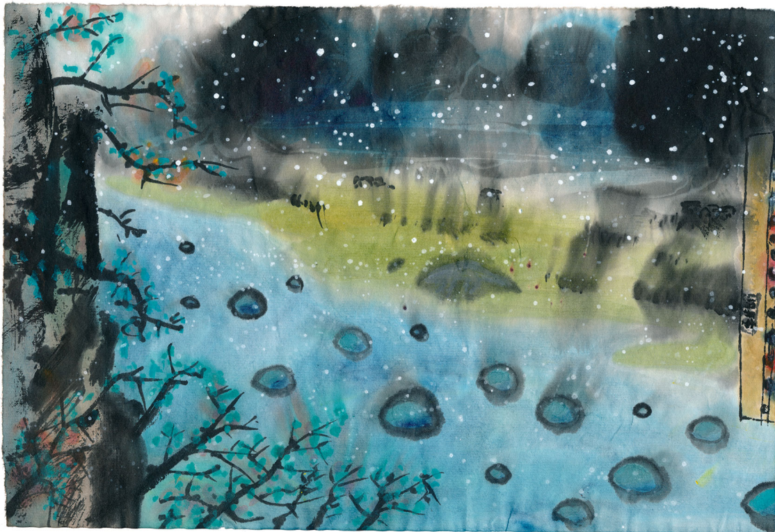
Just because. Chinese ink painting (28×19 cm). 2023.