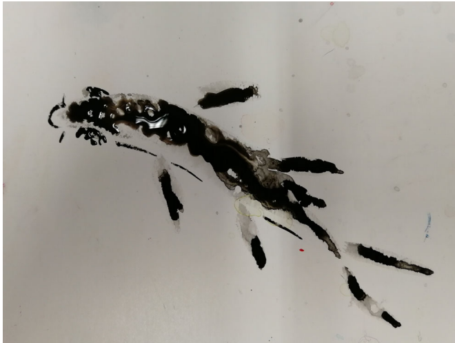
Untitled. Digital photo (3968×2976 pixels) of a still wet Chinese ink painting on table. 2018.