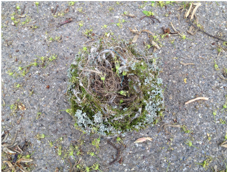
Wunder (engl. Miracle ). Digital photo (3264×2448 pixels) of a bird's nest. 2013.