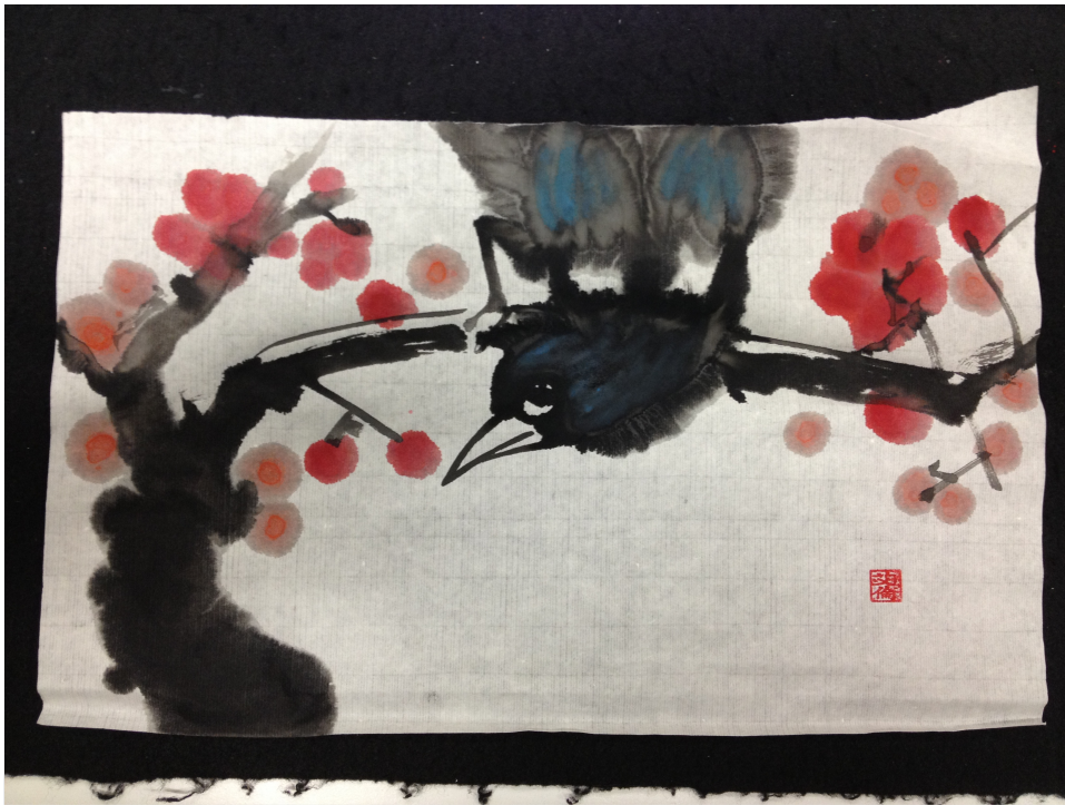
Magpie . Digital photo (3264×2448 pixels) of a Chinese ink painting (38×24 cm), taken while still wet on the black painting pad. 2013.